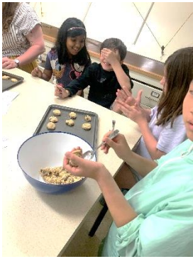
Lots of baking!

This summer, as the 2024 Summer Ministry Assistants at Wolfville Baptist Church, we had the wonderful opportunity to plan, facilitate, and assist with a variety of programs, including the weekly summer program, EDGE kids on Sunday mornings, EDGE youth events, and Vacation Bible Camp.