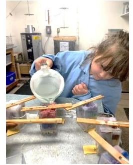
A fan-favourite activity: candle making at L'Arche!

Our summer program, held weekday mornings from July 2 to August 8, welcomed 43 children over the course of the season. Some attended for just one week, while others joined us for all six weeks, with an average of 13 children participating each week. The program featured activities centered on themes of recreation, life skills, creativity, and outreach, including highlights like geocaching with a hidden treasure chest, baking, stained glass painting, and a memorable visit to L'Arche Homefires.