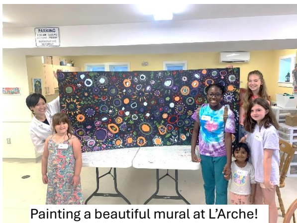
Painting a beautiful mural at L'Arche!