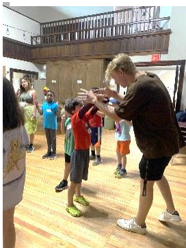
Music Day - actions got a little silly!

On Sunday mornings, from June 30 to August 18, EDGE kids enjoyed engaging activities during our worship services. Activities included songs, games, and crafts, all with the purpose of reinforcing each week's Bible lessons while praising God's name.